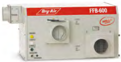
* Thorough drying achieved by Bry-Air's desiccant dehumidifiers