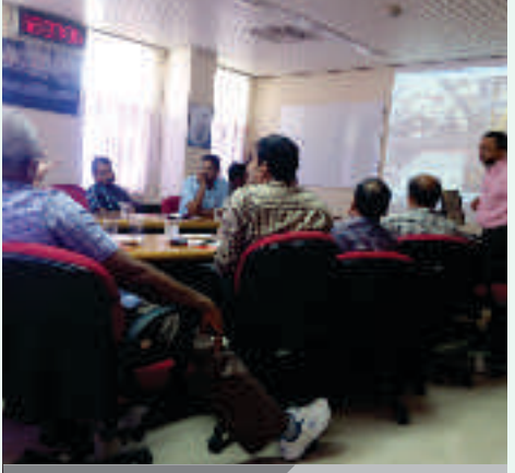
NTPC, Kayakulam, Kerala